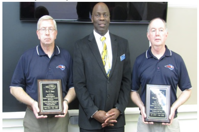
A Retirement Celebration was held on March 1, 2016.